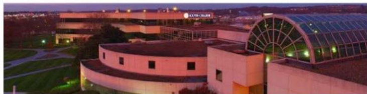
South College Knoxville, Tennessee

The Master of Physician Assistant Studies program at South College located at the foothills of the Smoky Mountains in Knoxville, Tennessee is a rigorous 27-month curriculum that builds on your previous education to qualify you for advanced physician assistant positions throughout the medical field.